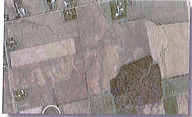
Aerial view of tile drainage.

Tile Drainage involves the installation of perforated large diameter pipe (four inch minimum) two to four feet below the soil surface across the area of a field where soil subsurface drainage and infiltration are poor. Water moves down through the soil profile into the perforated pipe and then flows through the pipe to a drainage ditch. When the sub-soil moisture is drained to the depth of the pipe, the water stops flowing. Tile drainage is typically used in the United States corn belt, southern Ontario and high rainfall areas of Manitoba. In Saskatchewan, it has been used to drain surface water by laying a single pipe from the centre of the wetland to an outlet.