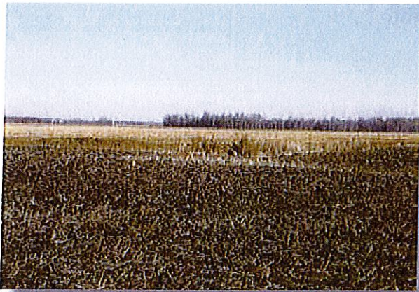
Berm for dyking

Dyking involves the creation of small earthen embankments to redirect water draining off a landscape into a drainage ditch or waterway instead of allowing the water to flow across the field or into a temporary wetland. Dyking may also be used to temporarily hold water on a field for irrigation.