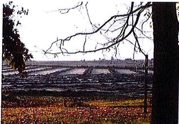
Field with recently installed tile drainage.

Tile Drainage involves the installation of perforated large diameter pipe (four inch minimum) two to four feet below the soil surface across the area of a field where soil subsurface drainage and infiltration are poor. Water moves down through the soil profile into the perforated pipe and then flows through the pipe to a drainage ditch. When the sub-soil moisture is drained to the depth of the pipe, the water stops flowing. Tile drainage is typically used in the United States corn belt, southern Ontario and high rainfall areas of Manitoba. In Saskatchewan, it has been used to drain surface water by laying a single pipe from the centre of the wetland to an outlet.